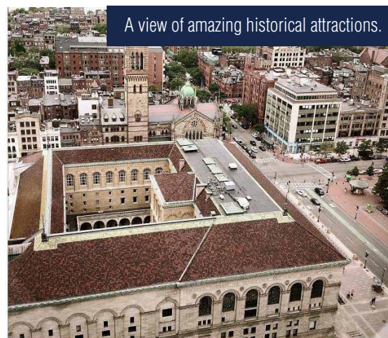
A view of amazing historical attractions.

Pets are welcome at the Westin Copley. Ask the concierge to show you walking paths along the Charles River or pet-friendly parks so you and your pup can feel right at home.