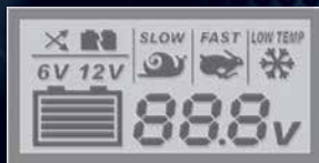
State of the Art LED